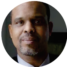
James Demby Department of the Army Washington, DC